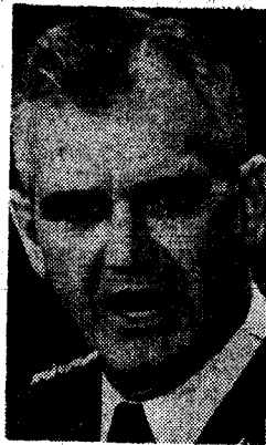
The Washington Post

The President also announced at a news conference