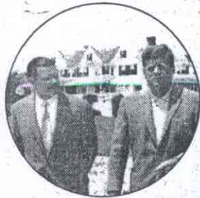
Six months into his seven years as secretary of defense, McNamara, above, meets with President Kennedy in Hyannis Port, Mass., in 1961. Preoccupied with Vietnam four years later, right, he confers with Gen. Maxwell D. Taylor, the U.S. ambassador to Saigon.