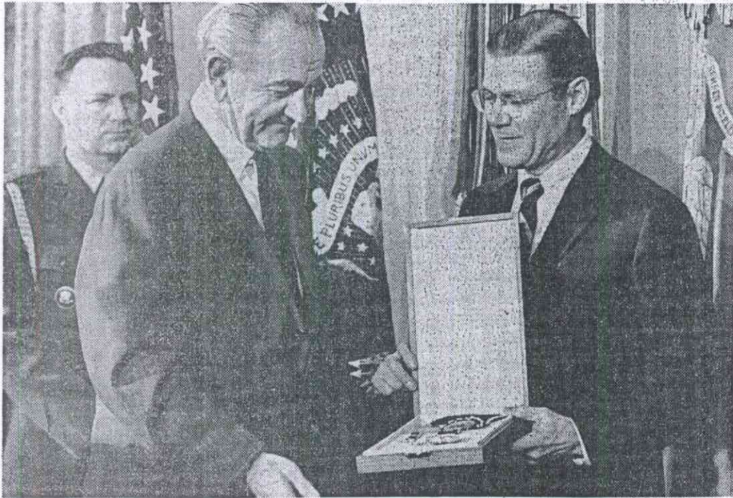
UNITED PRESS INTERNATIONAL