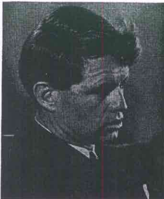
Senator Robert F. Kennedy