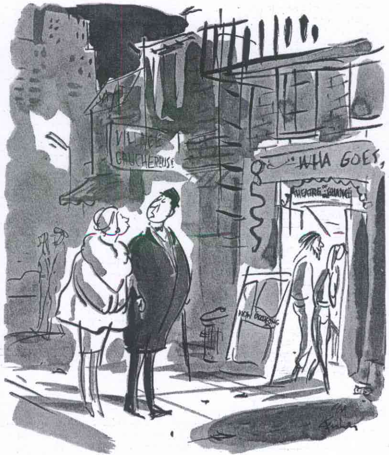
"When S. Hurok stages a happening, then I'll go see a happening!"

THE right of privacy continues to be delineated. No precise lines can be drawn. The continuing development of easy and swift means of communication changes the nature of the problem almost daily. The conflict between the right of privacy and the right to know is obvious. The resolution of any particular cases of the conflict provides a point of departure for the next. There are no final answers nor can there be. The need to protect both rights is manifest. Marking out the shadowy borderline is one of the prices of a free society.