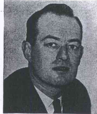
Author William Manchester