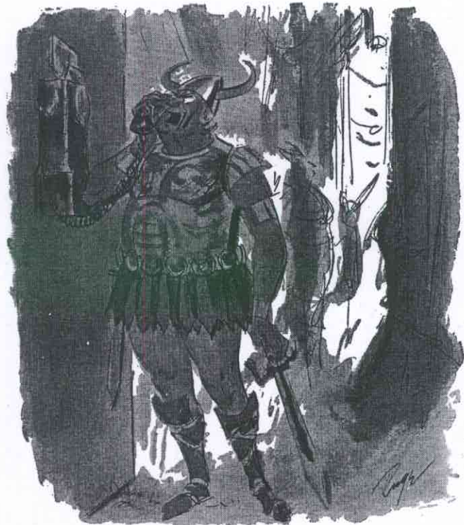
"How many times do I have to ask you not to phone me at work?"

The saddest aspect of the whole affair is that everything she had hoped to have told only the way she wanted it, artistically arranged to avoid any semblance of sensationalism, was ripped out of its graciously compassionate and almost worshipfully understanding context—and broadcast in stark and ghoulish skeletal form, undergoing that worst of fates, to be summarized in newspaperese.