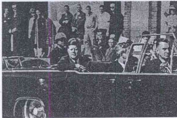
DEATH RIDE: President Kennedy in motorcade moments before he died.

"State law prohibits the removal of a body from the state where death was due to violent causes without a release signed by the Governor, the Lieutenant Governor,