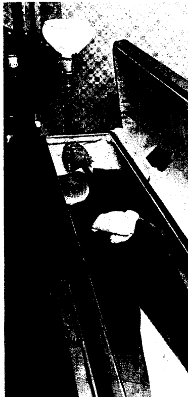
Malcolm X, lying in state after his assassination.