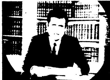
After the accident which killed Mary Jo Kopechne, Ted Kennedy explained what happened on TV — but his version of the tragic events has always been in doubt.