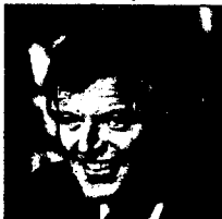
Kennedy's New information?