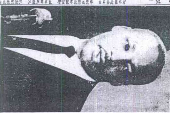
DR. MARTIN LUTHER KING, JR.

Memphis, April 4 (AP)— The Rev. Dr. Martin Luther King Jr., the apostle of non-violence in the American civil rights movement, was killed by a sniper's bullet today.