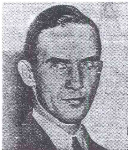
The New York Times