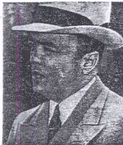
The New York Times