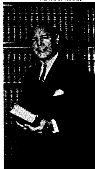
ATTORNEY GENERAL FINAN

any capacity who becomes a figure in "public debate."