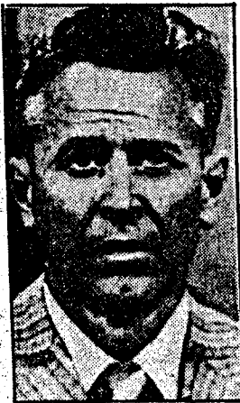
JAMES E. RAY