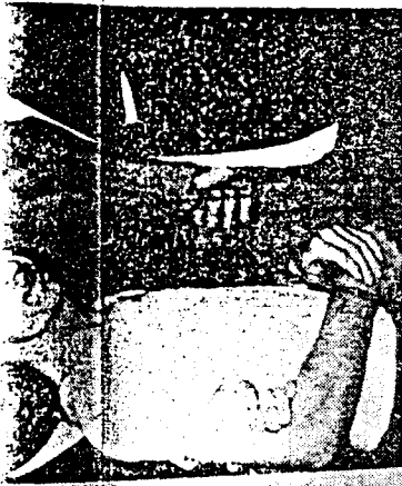
LEE HARVEY OSWALD AND THE DALLAS POLICE He was questioned, without counsel, for 48 hours annual budget of almost $500,000. For more than four years he was an FBI agent before becoming district attorney.

Wade is not new to the ways of law enforcement and prosecution. He has held the post of district attorney in Dallas 13 years. He has a staff of 80, and an