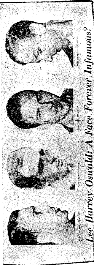
Lee Harvey Oswald: A Face Former Infamous?

It would seem that the Secret Service move was dictated by a desire to prevent any truthful leaks from Mrs. Oswald's family or friends or through the press in reference to her views. At about the same time more Secret Service and FBI "leaks" regarding Marina Oswald's recollection of her late husband's "attempt to shoot Gen. Walker with the same assassination rifle" flooded the front pages of every daily in America. Marina Oswald's assertion that she never even knew