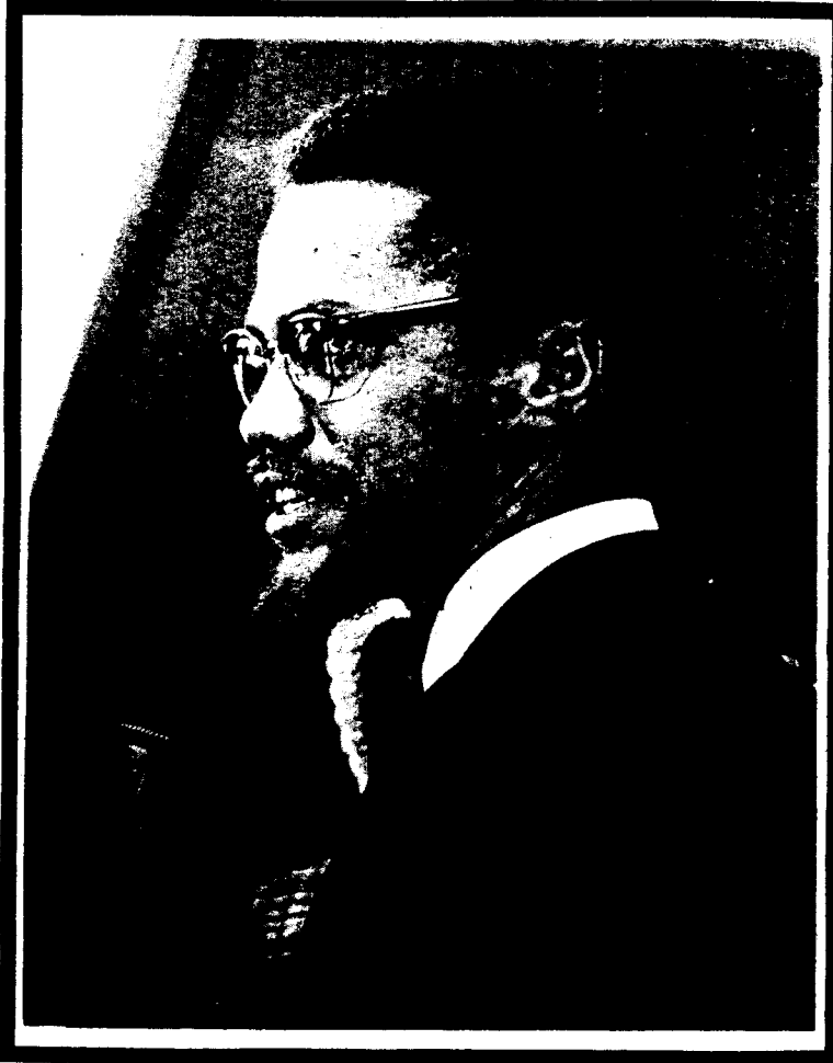
The late MALCOLM X