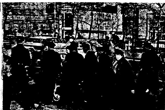
Malcolm X being rushed to the hospital