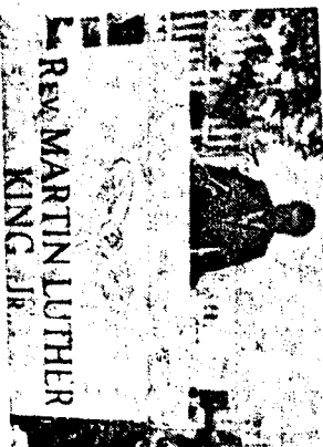
REV. MARTIN LUTHER KING JR.

by Yvonne Burke, together with their colleagues of good-will, can illuminate the dark corners of this mystery. Among the members of the caucus are some of those who served valiantly and selflessly with Dr. King, including Andrew Young and Walter Fauntroy. It is fitting that the commitment to morality, truth and fundamental human decency that Dr. King shared with his colleagues may yet bring us from the night of horrors into the land of which Dr. King dreamed. NW