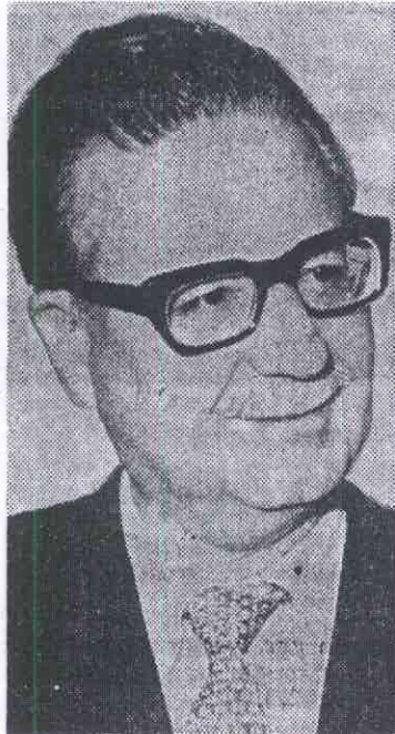
From left: Gen. Roberto Viaux, held back by Washington; Chilean President Salvador Allende; former Ambassador