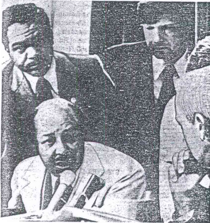
CONGRESSIONAL HUDDLE — Rep. Louis Stokes, D-Ohio, chairman of the House Assassinations Committee, considers an objection by James Earl Ray's attorney, Mark Lane. Behind Stokes is Del. Walter Fauntroy, D-D.C. and another member of the assassinations panel.

— The committee produced a woman, now 75, who said from a wheelchair that she had made out laundry and dry-