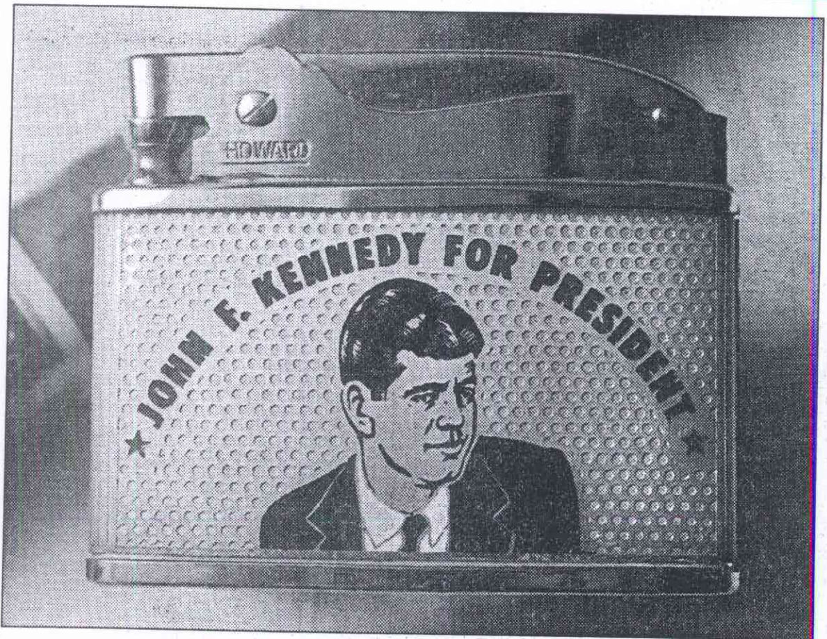
Among the Guernsey's auction items were a stainless steel cigarette lighter created for the 1960 presidential campaign and a 1930s travel diary kept by Kennedy's sister Kathleen, who died in a plane crash in 1948.