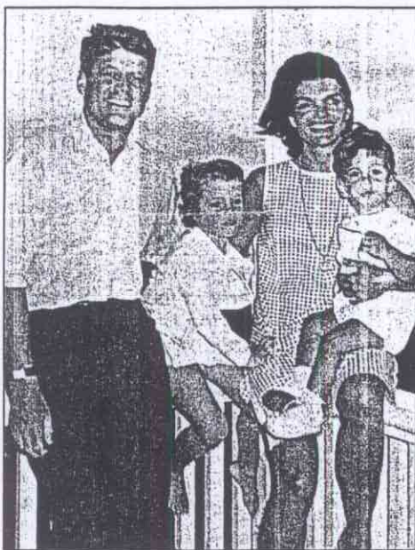
Jack and Jackie had their happy times. Her last words to him were: "I love you"

■ Jackie believed that Lee Harvey Oswald did not act alone. "She thought he was a pathetic little creature who was incapable of committing such a difficult crime," says our source.