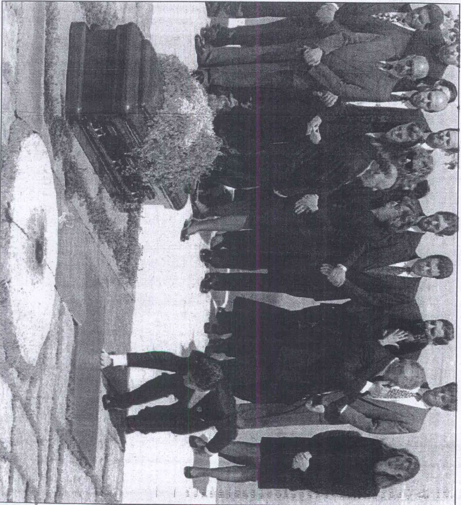
John F. Kennedy Jr. touches gravestone of father at Arlington, where mother is laid to rest. Behind him, sister Caroline Kennedy Schlossberg.