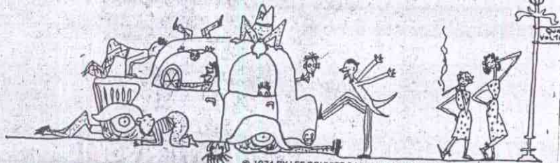
One of Jacqueline Bouvier's whimsical drawings about her European travels in 1951, later published by Delacorte Press in "One Special Summer."