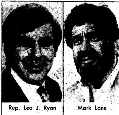
Rep. Leo J. Ryan