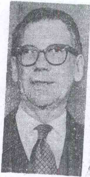
WILLIAM V. BROE ... CIA official testifies