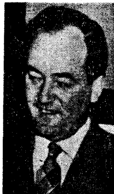
CANDIDATE —This picture was taken in Minneapolis on the day Hubert H. Humphrey was first elected to the U.S. Senate in 1948.

part of his style as is his cheerfulness and his ability to talk at length and intelligently about almost any subject.