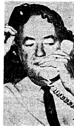
GETS WORD — Here Humphrey gets the word during the Democratic National Convention in Atlantic City that he has been summoned to the White House to discuss the vice presidency.

What bothers Humphrey's friends the most about his Vietnamese stance is his hyperbole, which is as much a