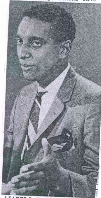
LEADER Stokely Carmichael talks of using any force necessary to attain objectives.