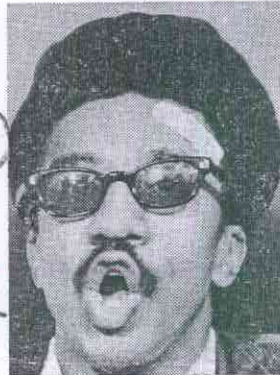
MILITANT Rap Brown preaches revolution.

"Preparation of maps showing the locations of the homes of mayors, chiefs of police, and similar authorities so they can be eliminated by Mau-