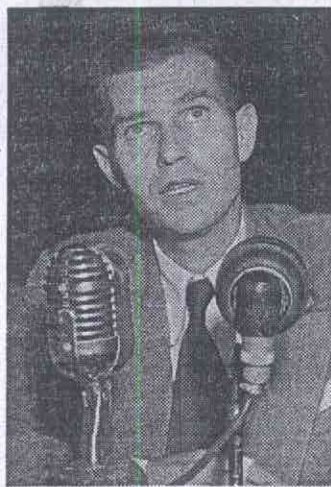
Alger Hiss denies accusations in 1948 that he was a Russian spy.