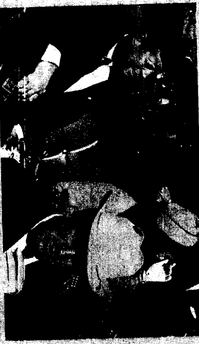
FLASHBACK: Kennedy moments before his death and (below) the so-called "Dallas tramps" who were rounded up shortly afterward. Man in middle is allegedly Charles Harrelson, Woody's father.

been received by Woody on the set as well as at home," the close friend disclosed. "And each time, the caller threatens Woody's life and