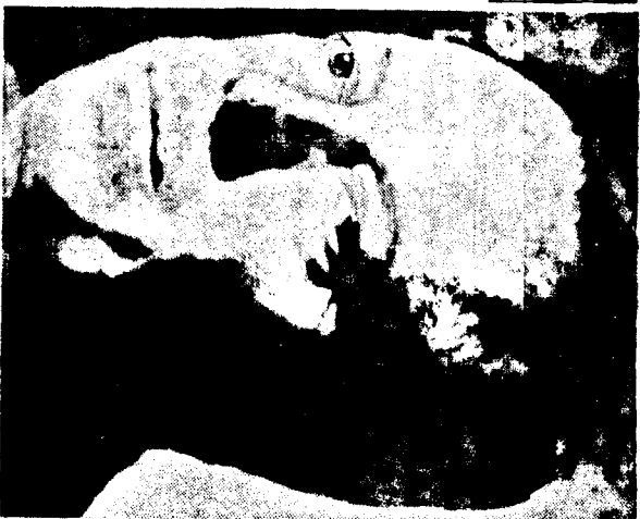
D.A. JIM GARRISON Blames military-industrial complex

"For my country's sake, I hope the truth will come out somewhere." Was President Kennedy really mur-