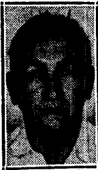
David W. Ferrie

"The apparent suicide of David Ferrie ends the life of a man who, in my judgment, was one of history's most important individuals," Garrison said.