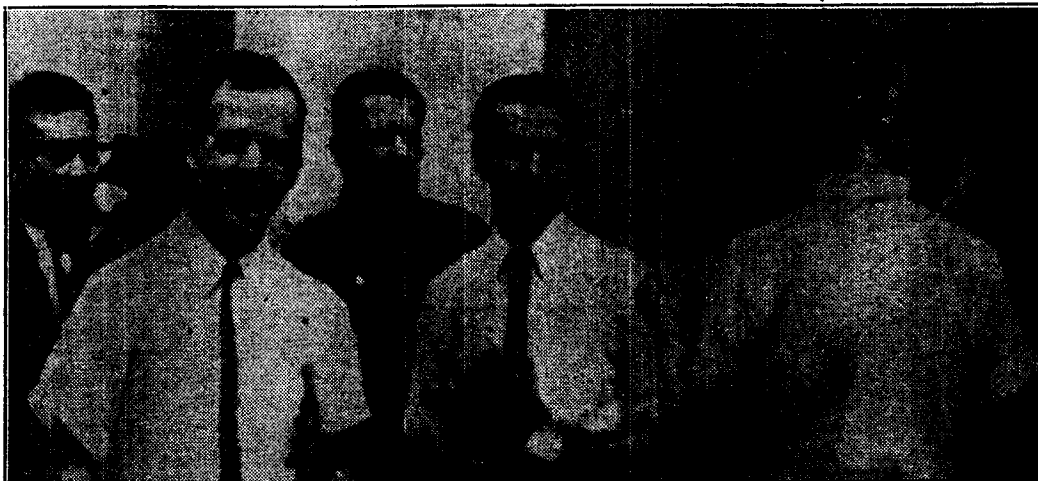
Lee Harvey Oswald, in white shirt at left, hands out pro-Castro leaflets in New Orleans, where district attorney now claims to have "solved" President Kennedy's assassination. Amid rising skepticism in Washington, New Orleans DA says Oswald was one of several co-conspirators who plotted to kill Kennedy.

ture publicity, arrests which were "probably just a few weeks away" were now "most certainly months away." But he insisted that "there is no question there will be arrests, charges and convictions."