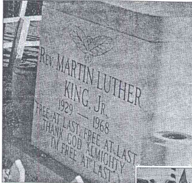
Tombstone of MARTIN LUTHER KING (left) and (below) the great civil rights fighter leads protest march in the rain. Many suspect that his assassination in 1968 was the end result of an extensive FBI harassment campaign.

The FBI has been very much in control for over fifty years. It has refused to investigate organized crime — in fact, has covered up for such renowned "anticommunists" as Meyer Lansky and Sam Giancana; forged the "Atom Spy Ring" hoax of the fifties in order to justify Hoover's man, Senator Joseph McCarthy; forged evidence in the Alger Hiss case, thus making Richard Nixon the FBI's loyal ally until his election to the Presidency; spent tens of millions of dollars to destroy Martin Luther King and others who