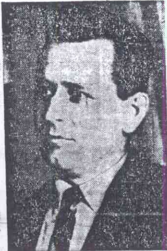
James Earl Ray

body. The sheriff was the kind of man who would walk alone down the center of the street in 'High Noon.' "