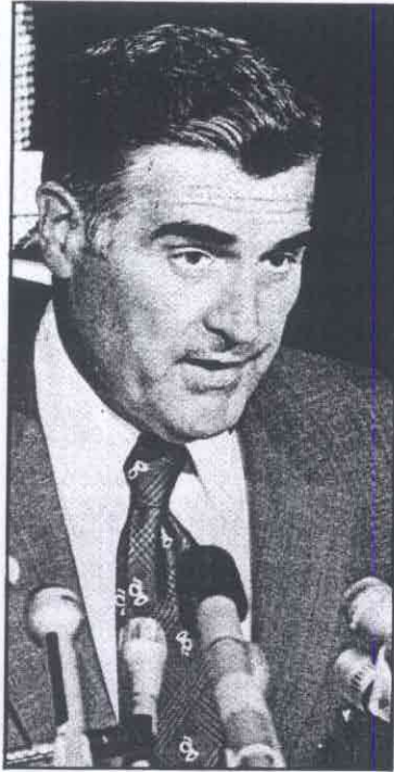
William Sullivan: The man who knew the FBI's secrets

Through the 1960s, Sullivan had been chief of Division Five, the Bureau's super-secret intelligence branch. Division Five handled much of the FBI's investigation of the John F. Kennedy and Martin Luther King assassinations. It also ran the infamous Cointelpro (Counter Intelligence Program), an attempt to "neutralize" leftist organizations through such tactics as infiltration, monitoring of mail, burglaries and illegal bugging. So "Crazy Billy" Sullivan, as he was called for his maverick style, had been privy to the FBI's most sensitive secrets. He was forced out by Hoover in 1971 (the director feared Sullivan was angling for his job), but because of what Sullivan knew, even in retirement he remained a powerful and controversial man.