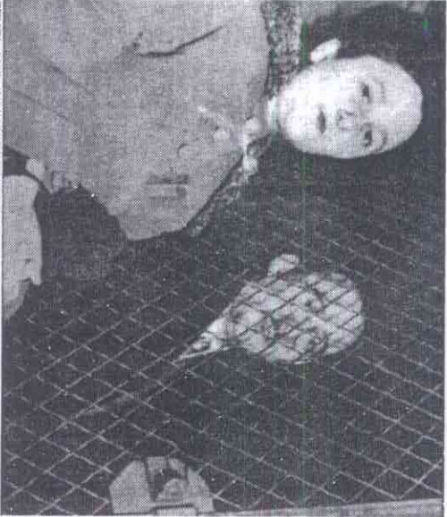
ETHEL AND JULIUS ROSENBERG