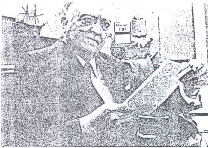
J. Edgar Hoover in his office, surrounded by mementoes. . . he was a man with his head in the clouds, according to his one-time No. 3.

finally persuaded the Russians he was the genuine article: an FBI man who wanted money in return for secrets.