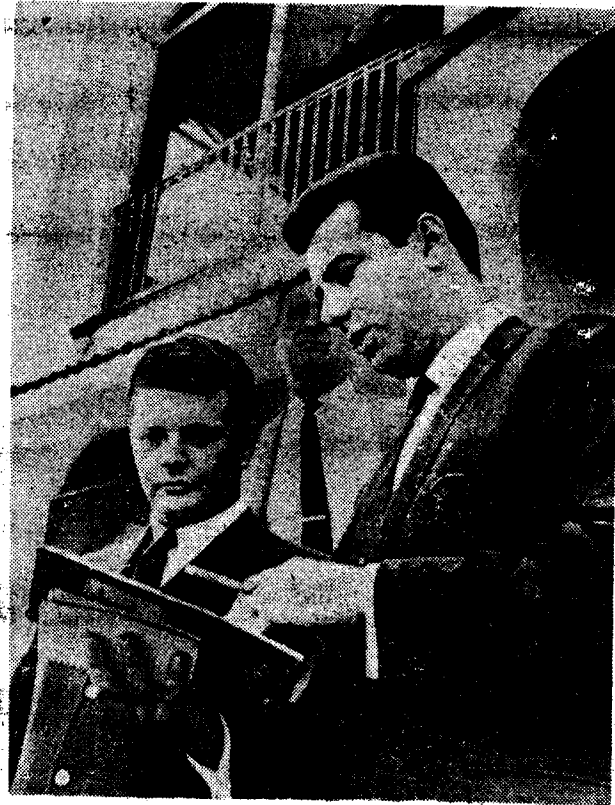
New Orleans DA investigators study notes outside home of David W. Ferrie.