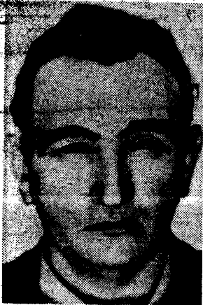
DAVID W. FERRIE

Garrison's suicide theory was expressed in a statement handed to reporters at a press confer-