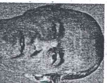
Richard M. Helms

...to be called for questioning by Senate Intelligence Committee