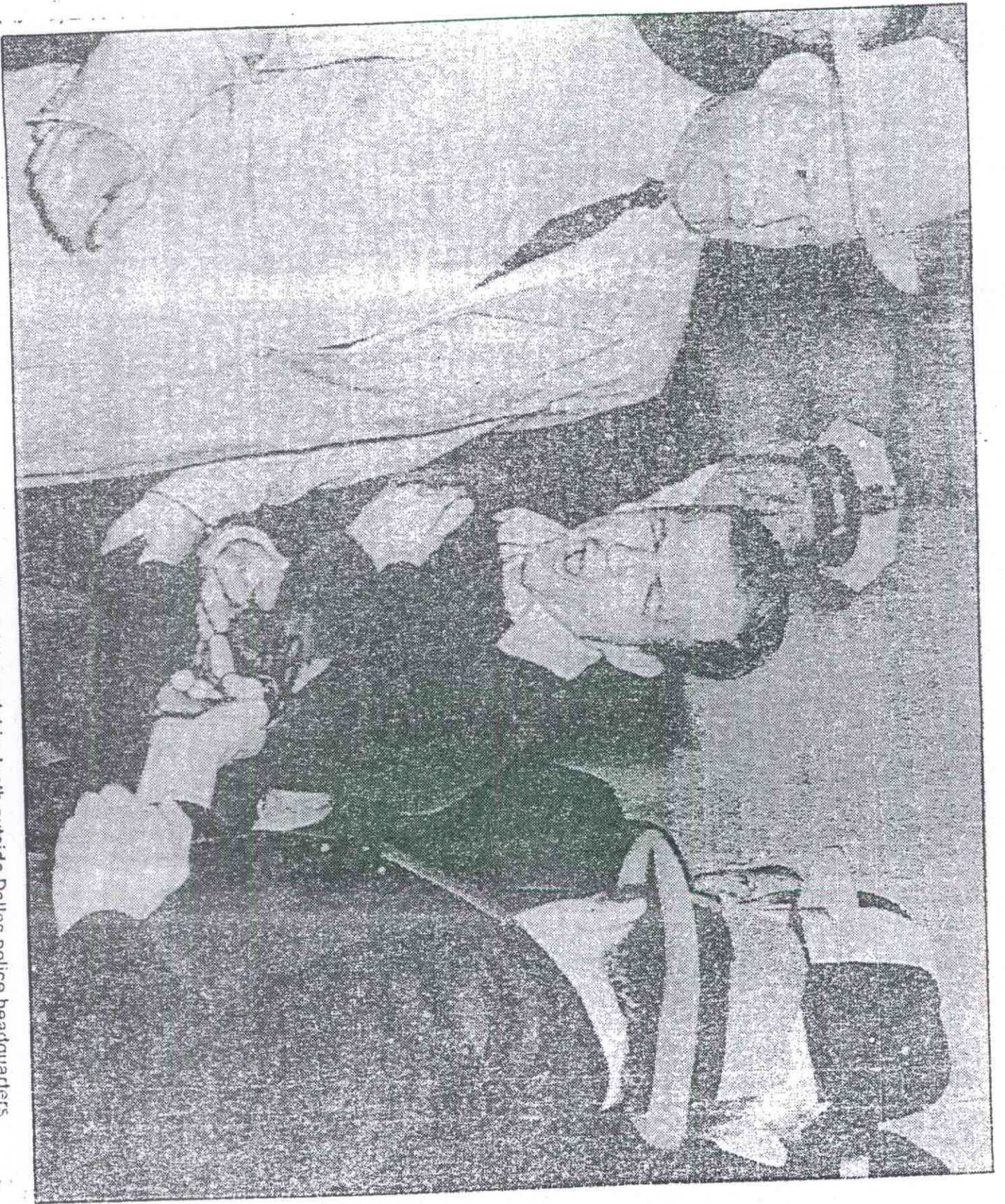
“Libra” imagines a scenario involving assassin Lee Harvey Oswald through his death outside Dallas police headquarters.