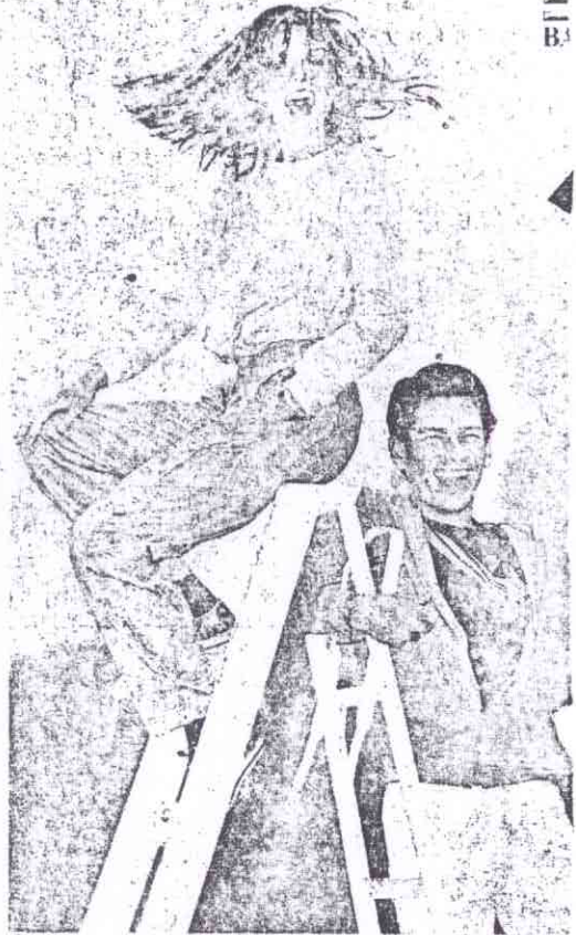
BASCO brings a new silhouette to the skyline hooded sweatshirt ($38), star T-shirt ($25) and For her: crossover sweatshirt ($32), gussef-