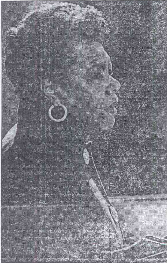
ANGELOU

Women, children, men, Take it into the palms of your hands. Mold it into the shape of your most Private need. Sculpt it into The image of your most public self. Lift up your hearts Each new hour holds new chances For new beginnings. Do not be wedded forever To fear, yoked eternally To brutishness.