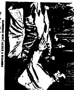
Garrison with LUCKY & SCALMIA The first with the power to do more than talk.