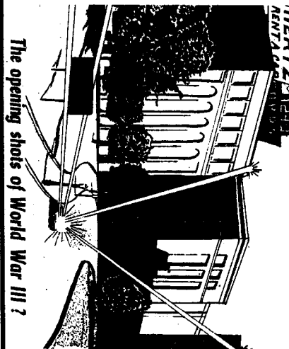
The opening shots of World War III ?

State Citizens' Committee of Inquiry, Washington State Citizens' Committee of Inquiry, 1964, 1965, 1966, 1967, 1968, 1969, 1970, 1971, 1972, 1973, 1974, 1975, 1976, 1977, 1978, 1979, 1980, 1981, 1982, 1983, 1984, 1985, 1986, 1987, 1988, 1989, 1990, 1991, 1992, 1993, 1994, 1995, 1996, 1997, 1998, 1999, 2000, 2001, 2002, 2003, 2004, 2005, 2006, 2007, 2008, 2009, 2010, 2011, 2012, 2013, 2014, 2015, 2016, 2017, 2018, 2019, 2020, 2021, 2022, 2023, 2024, 2025.