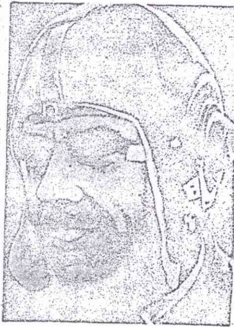
Russian cosmonaut Vladimir Komarov

The Soviets did not in- Turn to 23-A, col. 1.