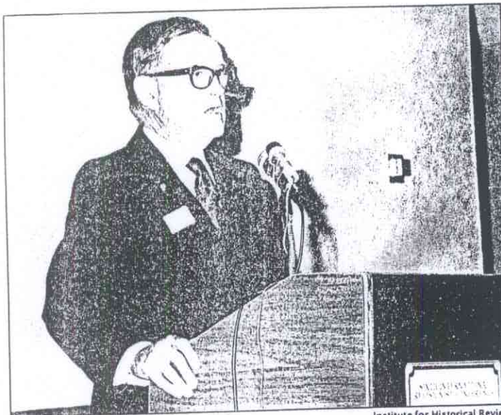
Institute for Historical Review

Willis Carto: "Only a few Negroes are genuinely in accord with the trouble-making policies of these two race-mixing organizations [the Urban League and the NAACP]. It is a sad, yet significant fact that both of these fraudulent outfits prosper by using the brains of Jews, the money of Jews and duped white Christians and the 'front' of raceless mulatto figureheads. But hardly a Negro in the lot." (cited in Drew Pearson and Jack Anderson column, "Washington Merry-Go-Round," October 26, 1966.