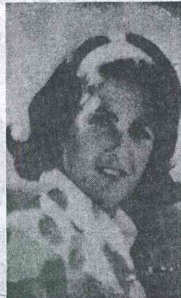
JUDITH CAMPBELL EXNER

under former President Richard M. Nixon, said it was the public's business when a president shares a close friend with a Mafia figure selected by the CIA to arrange the assassination of Castro.