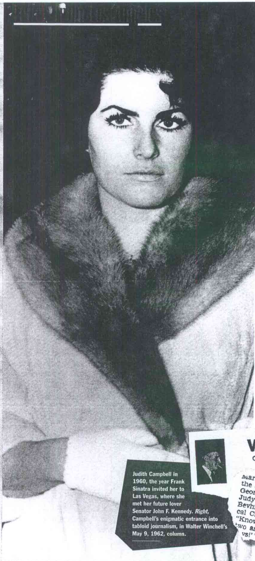
Judith Campbell in 1960, the year Frank Sinatra invited her to Las Vegas, where she met her future lover Senator John F. Kennedy. Right , Campbell's enigmatic entrance into tabloid journalism, in Walter Winchell's May 9, 1962, column.

J udy Campbell of Palm Springs and Bevhills is Topic No. 1 in Romantic Political Circles," wrote Walter Winchell in his column May 9, 1962. Of such mysterious little gossip items is history made. I've written thousands of them myself as a columnist over the years. As a child in Fort Worth, Texas, I used to lie on the floor of my parents' modest house studying Walter Winchell's column as if it were the Bible. I wanted more than anything to understand life at the top, to enter Winchell's fascinating world of the Depression 30s and