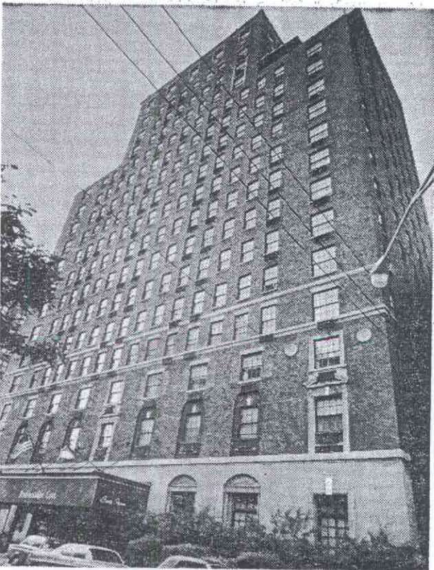
AMBASSADOR EAST HOTEL in Chicago, where Judy and Kennedy made love for the first time after he became President of the United States.

quickly moving around me and into the room. There was a