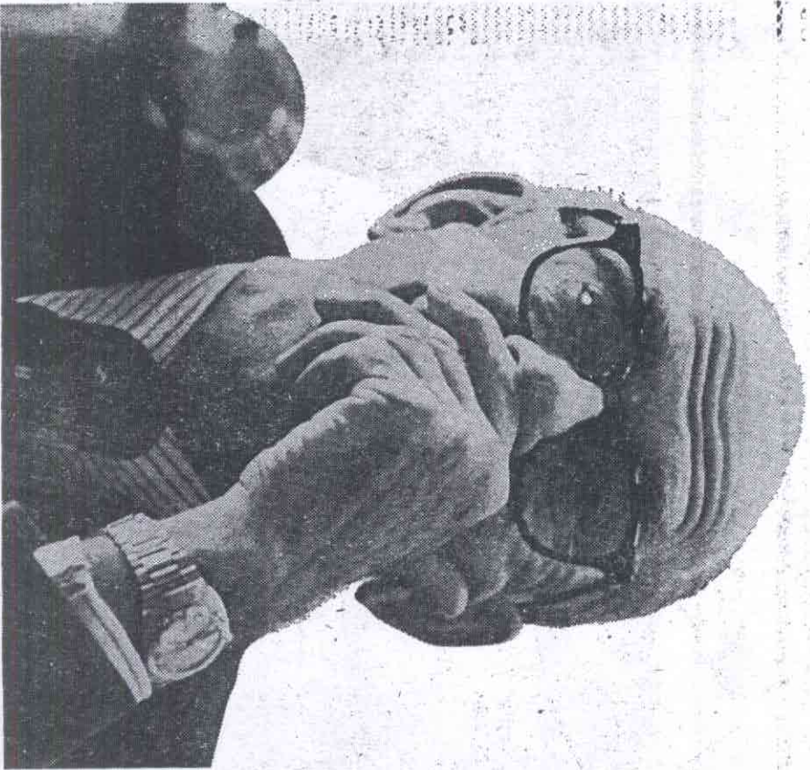
J. WILLIAM FURBRIGHT: "CIA just took the position that they weren't supposed to talk to us..."