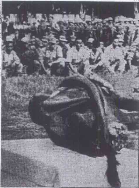
PLEDGING LOYALTY Heads or tails.