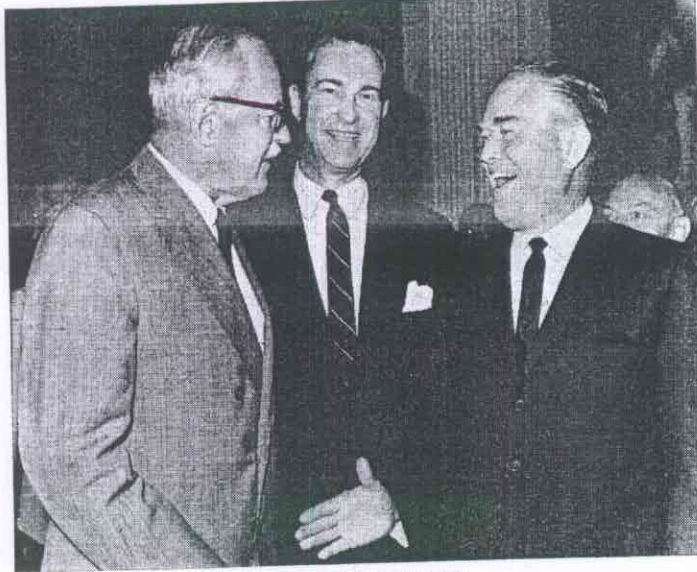
DULLES, HELMS & RABORN

The agency's workaday labors, the tedious accumulation and evaluation of infinite quantities of minutiae, have more in common with IBM's 360 than with Ian Fleming's 007. The task demands high intelligence as well as patience. A State Department veteran once said: "You'll find more liberal intellectuals per square inch at CIA than anywhere else in the Government." Indeed, the agency is staffed from top to bottom with some of the nation's best-qualified experts; 30% have Ph.Ds. They are linguists, economists, cartographers, psychiatrists, agronomists, chem-