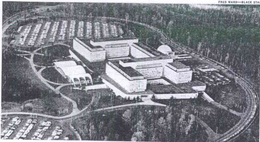
CIA'S LANGLEY COMPLEX Where IBM's 360 outranks Fleming's 007.

By the time John McCone resigned in 1965, Helms was one of his recommendations as a successor—a natural choice on the basis of experience and ability. He had recruited, trained, assigned and directed many of CIA's most trusted operations agents, and unlike many of his colleagues, he got along well with the State Department and the Pentagon. Nonetheless, President Johnson picked Admiral Raborn as director and made Helms the first deputy. There was a tacit understanding that Raborn's tour would be short and that Helms would use this period to establish himself with the Congressmen who oversee the agency's operations. Senate confirmation was unanimous, and Helms took over last June.