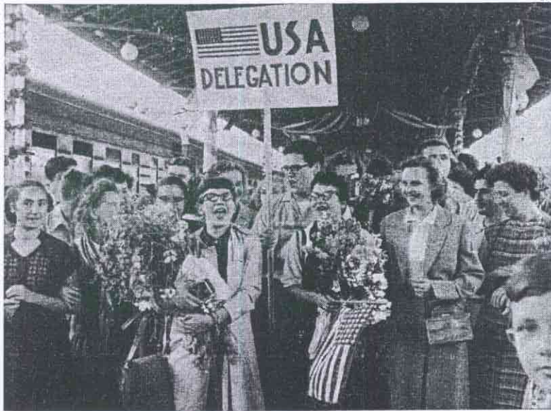
STUDENTS ARRIVING FOR WORLD YOUTH FESTIVAL IN MOSCOW (1957) Once again, a spotlight on the tightrope of paradoxes.

the emotionalism of young Americans who worship honesty. It aroused the outrage of many in the academic community who—mistakenly—regard CIA as an evil manipulator of foreign policy. And the furor showed again how readily Americans, who, while seldom acknowledging the quiet and generally successful performance of their intelligence com-