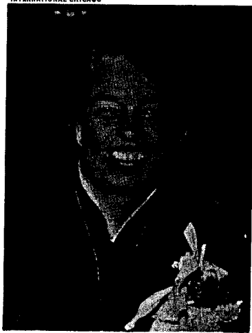
ON FILE: ELEANOR ROOSEVELT