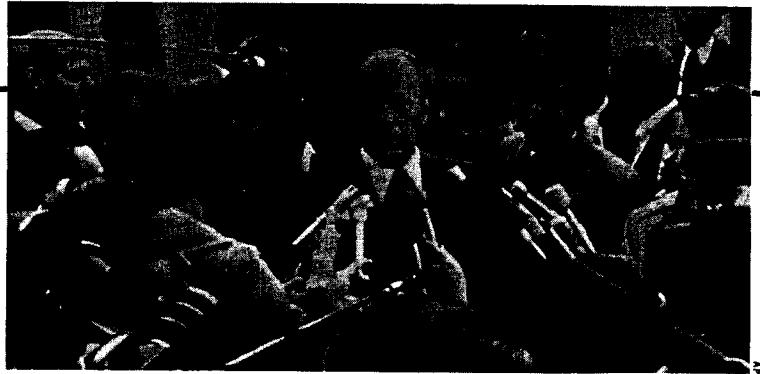
FORD MEETS THE PRESS ON THE WHITE HOUSE DRIVEWAY

That seemed to mean that the Senate committee probably will conduct much if not all of its probe in secrecy, as has been done so far by President Gerald Ford's commission to investigate the CIA. Its chairman, Vice President Nelson Rockefeller, said last week that his group has "been given a broad picture" of the situation by CIA Director William E. Colby and his predecessors, and would next "go into details with [the CIA] staff." Asked if the commission had found "extensive illegal spying," Rockefeller cautiously replied: "I would not say that what you have just said would be the impression left so far." Nonetheless, the furor over the CIA, FBI and other intelligence-gathering agencies was not likely to end until the Senate committee finishes its probe by the Democrats' proposed deadline of Sept. 1. At the very least, the committee is expected to recommend better congressional oversight of the agencies and legislation to ensure that they stick to the purposes for which they were established.