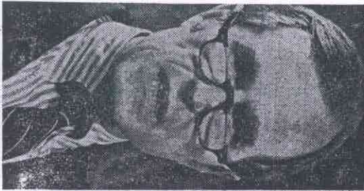
GEORGE BUSH ... met with Justice aides