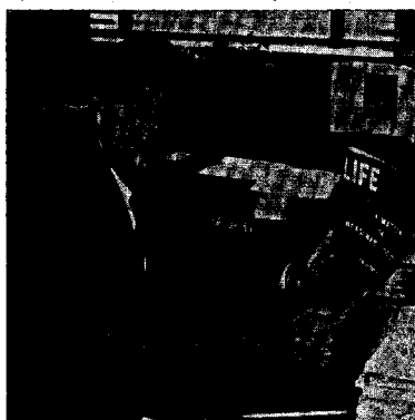
MUCH-THUMBED COPY of "Life" magazine may still hold new clues to the assassination mystery, believes LRL physicist Luis Alvarez (above).

The essence of Alvarez' contribution is the discovery that the Abraham Zapruder motion-picture films of the assassination, printed in Life and in the Warren Report, contain internal clues